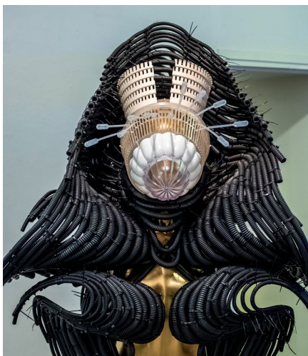
Sculptures by Leeroy New