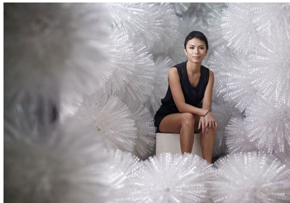
Light installations by Olivia d'Aboville