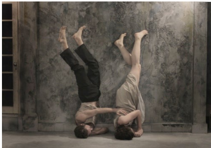
Reference © The day shall declare it